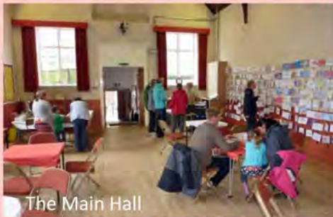
The Main Hall

The Church Hall is run by a committee of representatives from the community and used by various groups. These include the Scouts, Cubs, Beavers, Pre-School Playgroup, Brownies, Rainbows, Parent & Toddlers, Senior Citizens, Dance School, Whist Drives, Memory Café, artistic productions and keep fit.